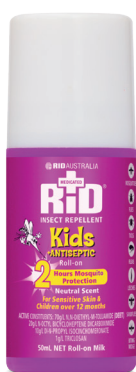
50ml Roll-on Milk

A mild formulation designed for children 12 months and over or those with sensitive skins that effectively repels.