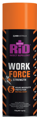
150g Aerosol Spray

Extra strong can designed for durability in tough workplace environments with a tropical strength protection for up to 6 hour protection.